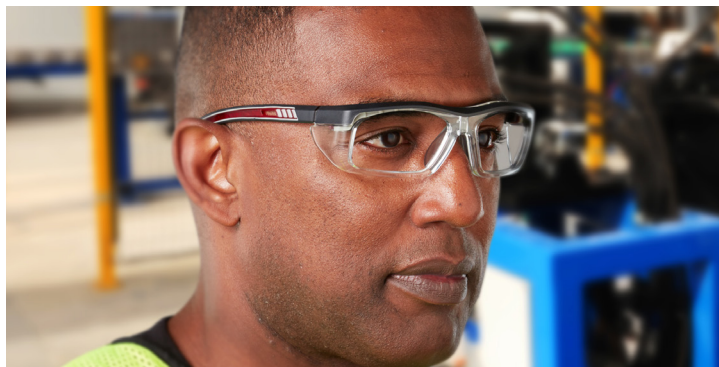
Image features ZT500 frames