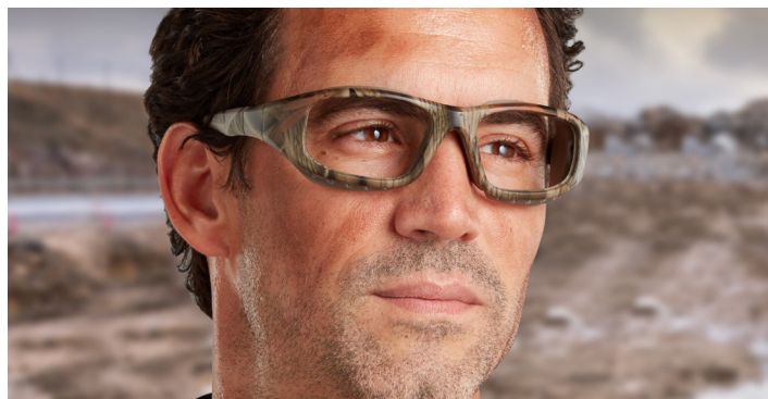
Image features ZT35 camouflage frames

Size 52 54 A 51.9 53.8 B 37.1 39.2 ED 55.5 58.0